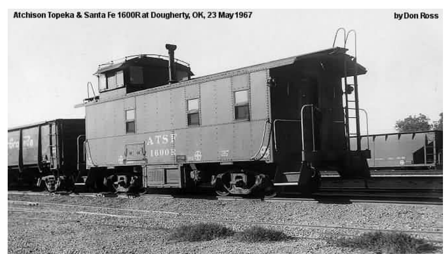
changes from that Typical ACF Steel ATSF caboose prior to rebuild as a Ce-1.

The Atchison. Topeka & Santa Fe Railway placed an order for its first allsteel way-cars (cabooses) with Amer-Car and Foundry in early 1927, asking for 150 cars. The original design was so successful, Santa Fe adopted it as its cessful, standard plan; and for the next 23 years, all subsequent orders for cabooses were placed with only slightest design original purchase order.