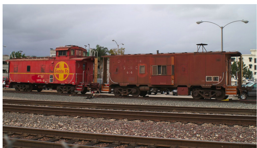
Microphor toilet with on- The SCSRA cabooses at Fullerton. The former AT&SF 999110 is on the left.

The ATŚF 999110 was donated to SCSRA by Pacific Rail Industries, Colton, Calif., in September 1989 and dedicated at Los Angeles' Travel Town in October of the same year. After 17½ years at Travel Town, the needs and wants of the City of Los Angeles changed and 999110, along with her SCSRA ex-Southern Pacific sister found a new home down the road in Orange County, with a secure display on the house tracks of Fullerton's Santa Fe Depot, arriving June 13, 2006.